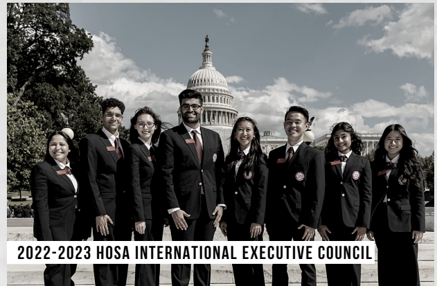
2022-2023 HOSA INTERNATIONAL EXECUTIVE COUNCIL