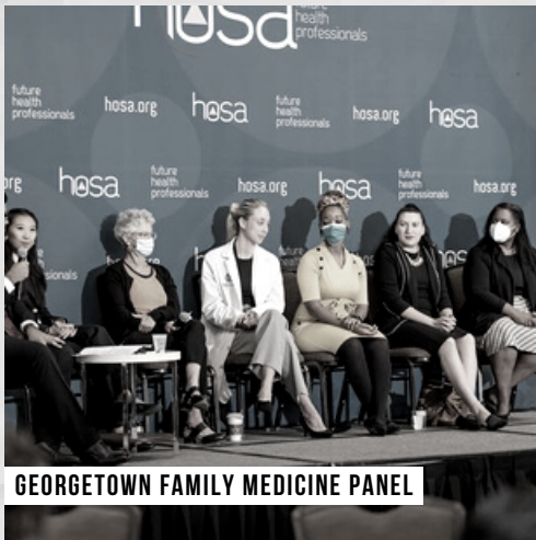
GEORGETOWN FAMILY MEDICINE PANEL