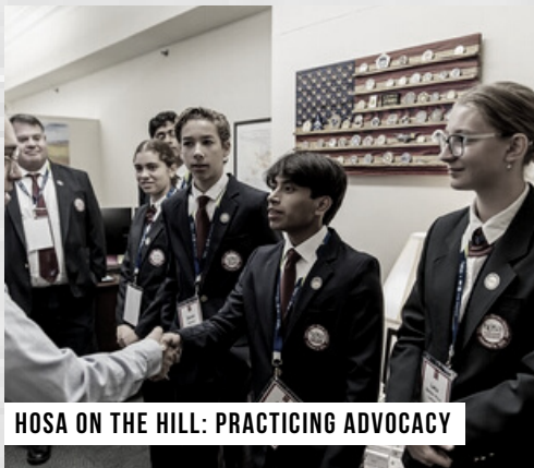
HOSA ON THE HILL: PRACTICING ADVOCACY