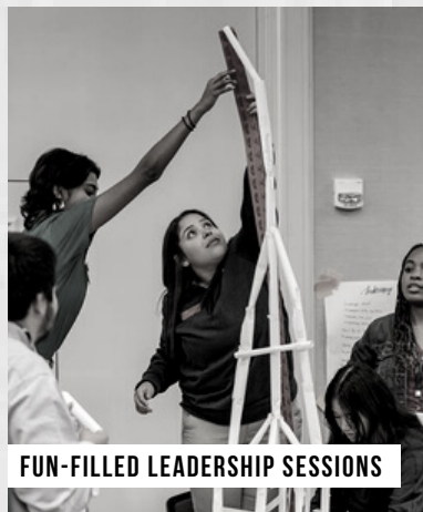
FUN-FILLED LEADERSHIP SESSIONS