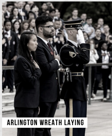
ARLINGTON WREATH LAYING