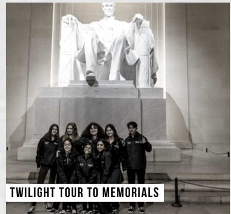
TWILIGHT TOUR TO MEMORIALS